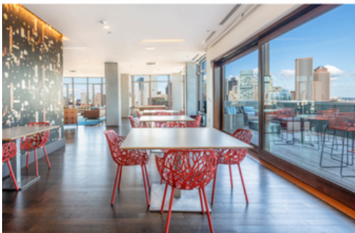
Rooftop Lounge in Boston's Seaport District